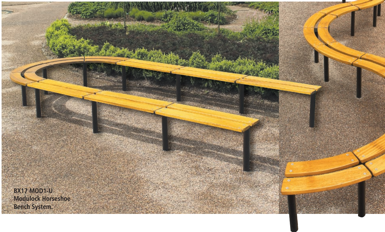
BX17 MOD1-U Modulock Horseshoe Bench System.